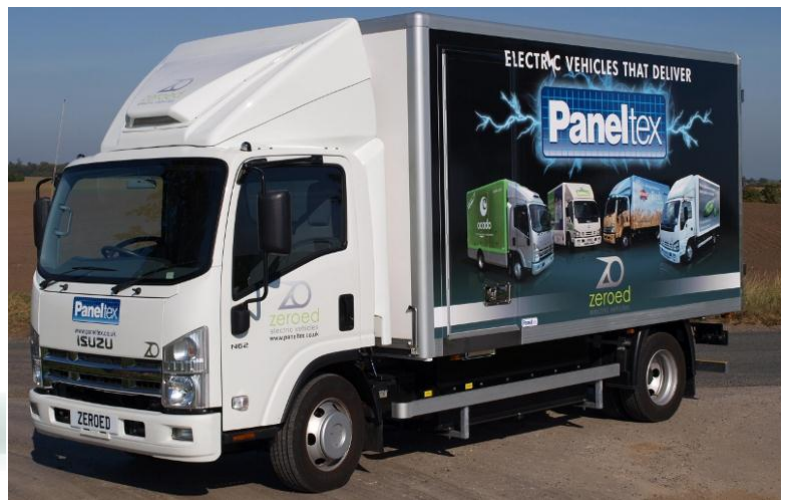
Nissan e-NV200 (left) and Isuzu / Paneltex Zeroed (right) pure electric vehicles